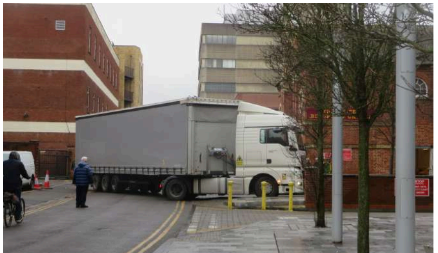
Setting off again

Maidenhead nearer the truck departure time.