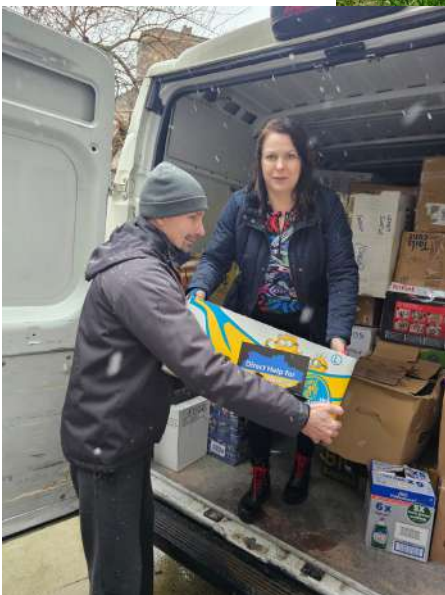
Deliveries safely arrived