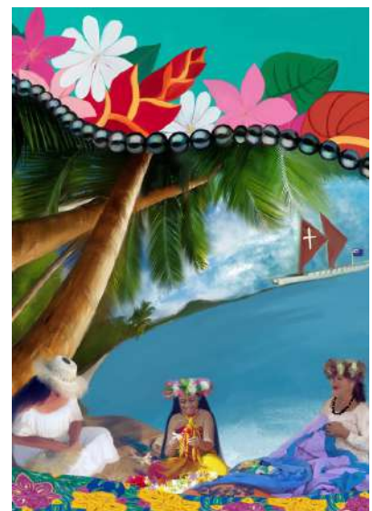
Cook Islands artwork

I try to count them—they are more than the sand; I come to the end—I am still with you."