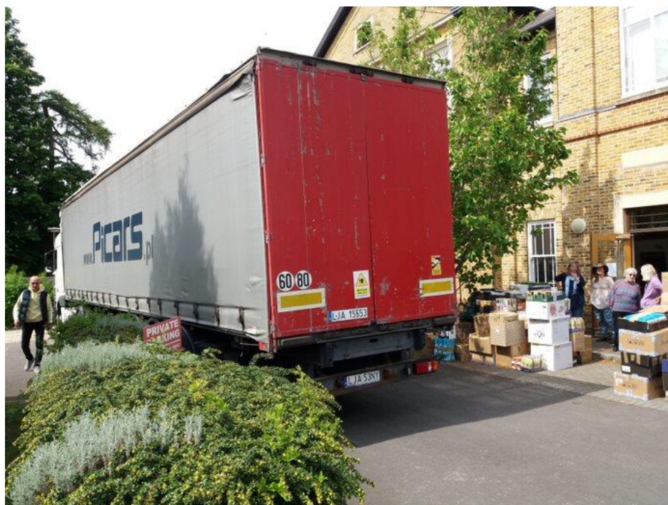
The truck at Christ Church on 9 May